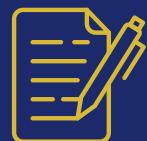
FREE WILL WRITING SERVICE

Staff can work across our family of schools, enabling our academies to benefit from wider expertise and to offer individuals fresh opportunities. Quality of life outside work significantly shapes the way in which people perform, so the need to achieve a healthy work/life balance is an important aspect of our commitment to staff.