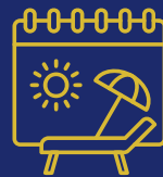
COMPETITIVE ANNUAL LEAVE